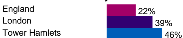
Chart 1. Proportion of workers on zero hours contracts by area

Around half (46%) of the workforce in Tower Hamlets were on zero-hours contracts. Over half (56%) of the workforce usually worked full-time hours and 44% were part-time.